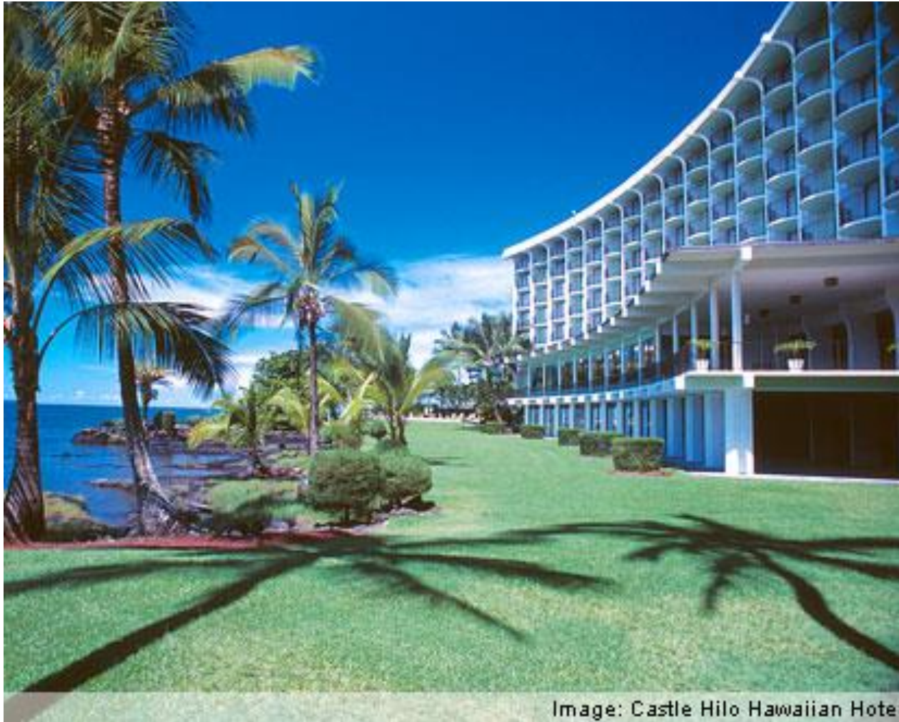
Image: Castle Hilo Hawaiian Hotel